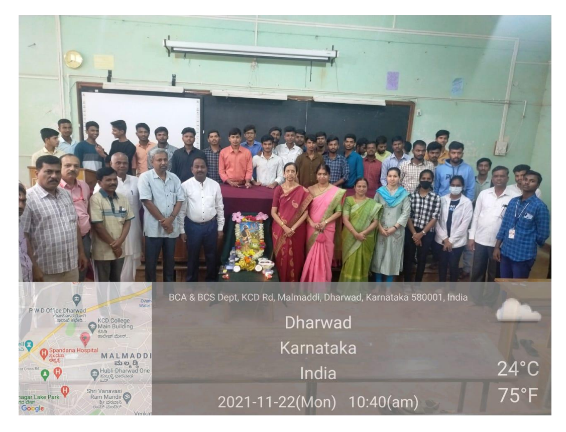
Kanak Das Jayanthi