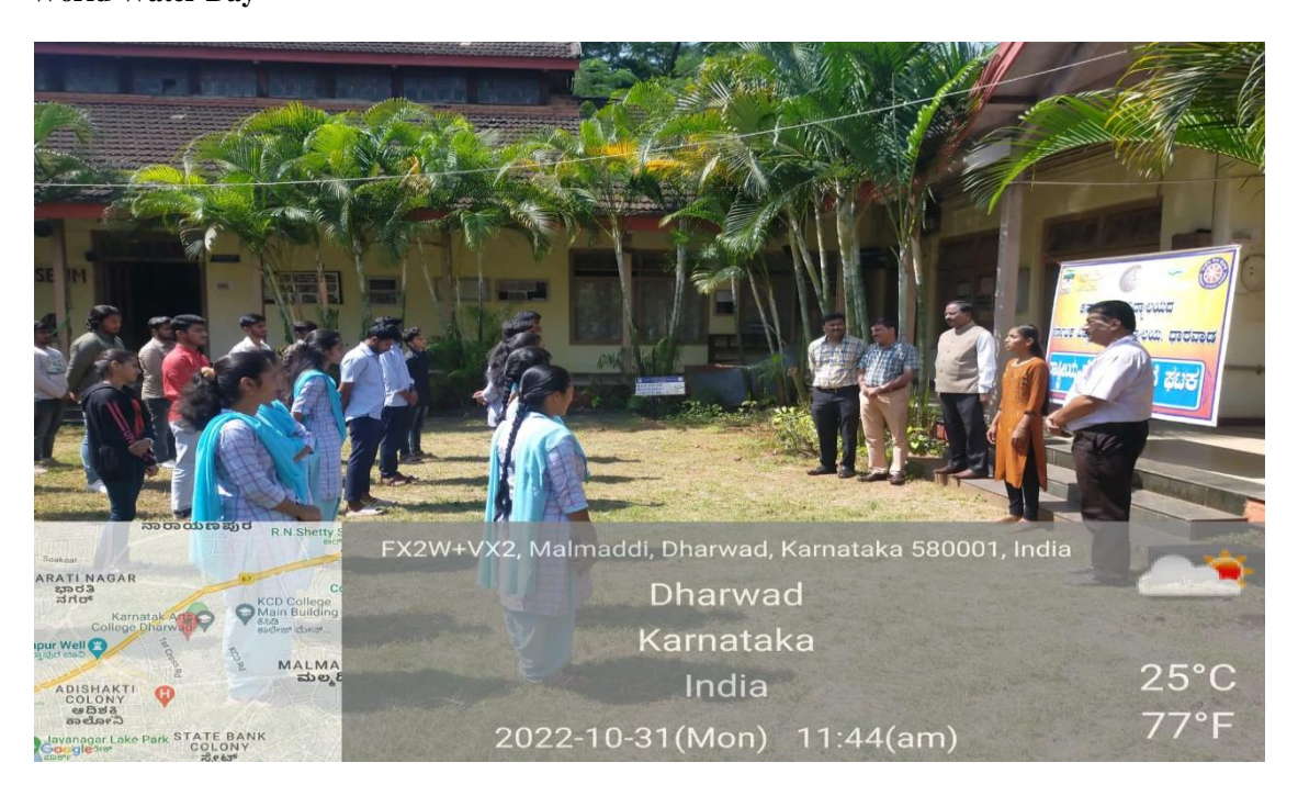
Observation of National Unity Day on account of anniversary of Sardar Vallabhbhai Patel.