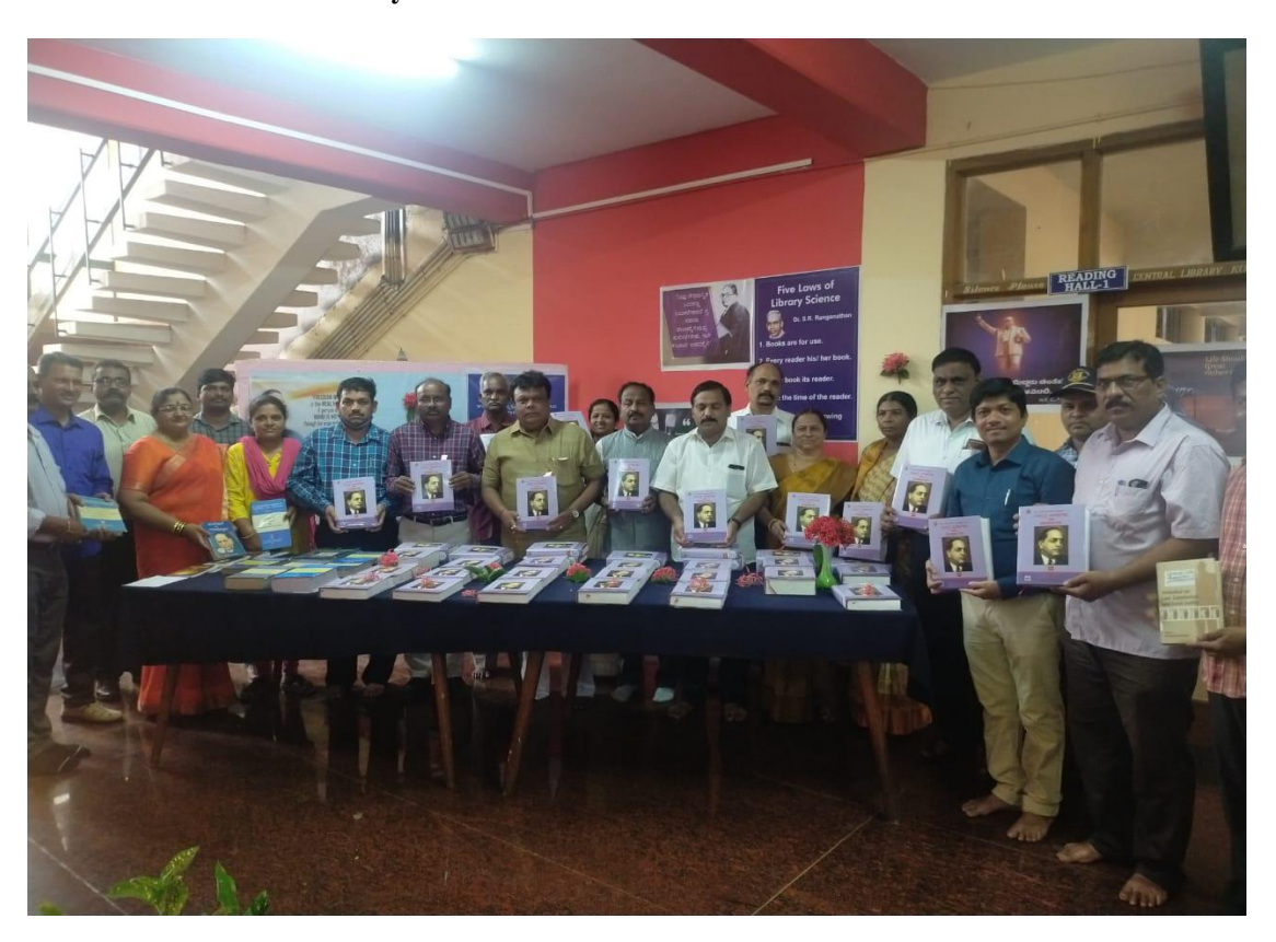
Book Exhibition on the occasion of Ambedkar Jayanthi